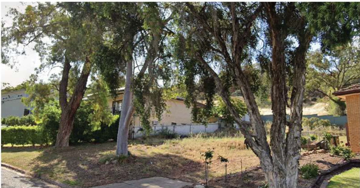
Street View of 46 Lawford Crescent Looking North West