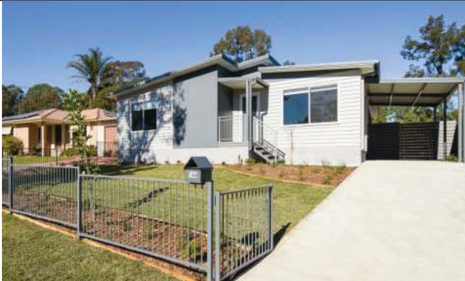
AHO property with cement clad and brick dwarf wall around footings.