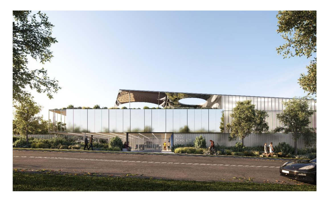
Figure 5: Photomontage of proposed facility as viewed from Church Street (Source: Fuse Architects)

The proposed waste transfer facility provides for a warehouse type building with a maximum height of 10.1m. The building provides an area for operations at ground level including space for the stockpile, weighbridges, odour management systems and car parking. The first floor level is cantilevered above the proposed parking area and odour management system and provides amenity for future staff through the provision of a rooftop terrace with associated green roof.