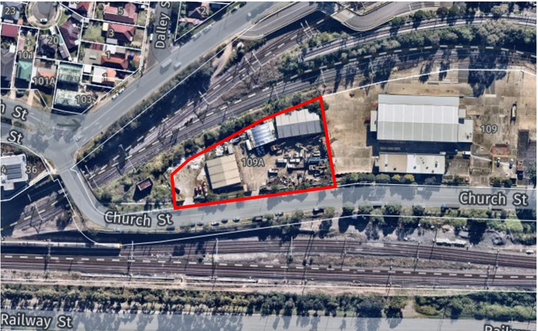
Figure 1: The Site

The site is located within an area zoned E4 General Industrial under the Cumberland Local Environmental Plan 2021 and is bordered by railway land to the north and west, Church Street to the south and a pallet manufacturing/distribution centre to the east.