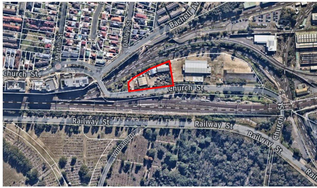
Figure 4: The Locality