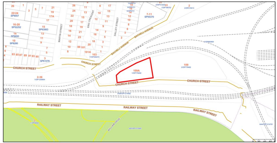
Figure 2: Location map of subject site