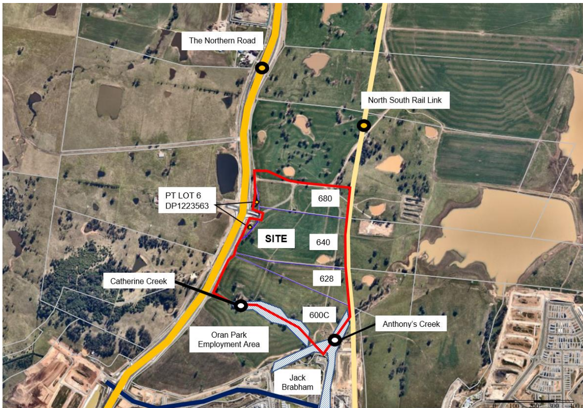
Figure 2 Site context