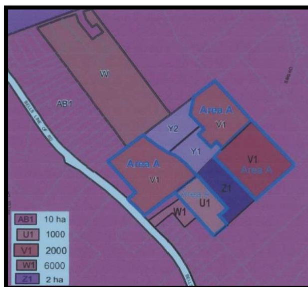
Figure 5: Application of Area A – subject to clause 4.1D

(b) the area of any lot created by the subdivision that contains or is to contain a dwelling house is less than 4,000 square metres.