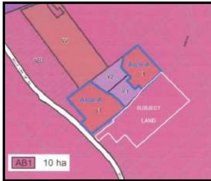
Figure 3: Lot Size Map