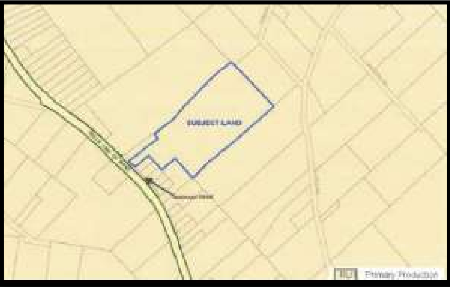
Figure 2: Land Zoning Map

Under the Hawkesbury Local Environmental Plan 2012, the site is currently zoned RU1 Primary production (refer to Figure 2), with a minimum lot size of 10 hectares (refer to Figure 3 - overleaf) and contains terrestrial biodiversity as identified on the Terrestrial Biodiversity map (refer to Figure 4 - overleaf).