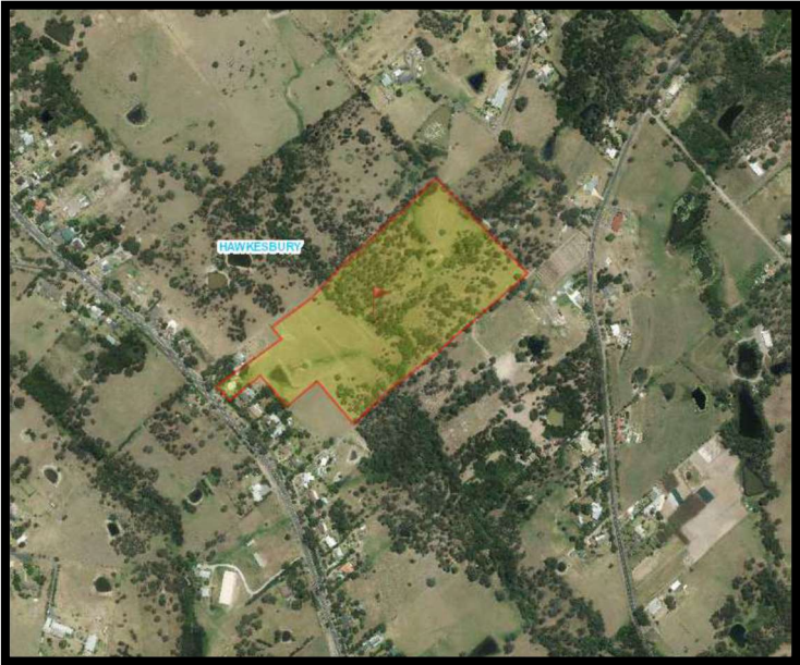
Figure 1: subject site highlighted in thin red outline.

The site, contains Shale Sandstone Transition Forest an endangered ecological community under the Biodiversity Conservation Act 2016 , as identified in the Flora and Fauna Assessment Report ( Attachment J ).