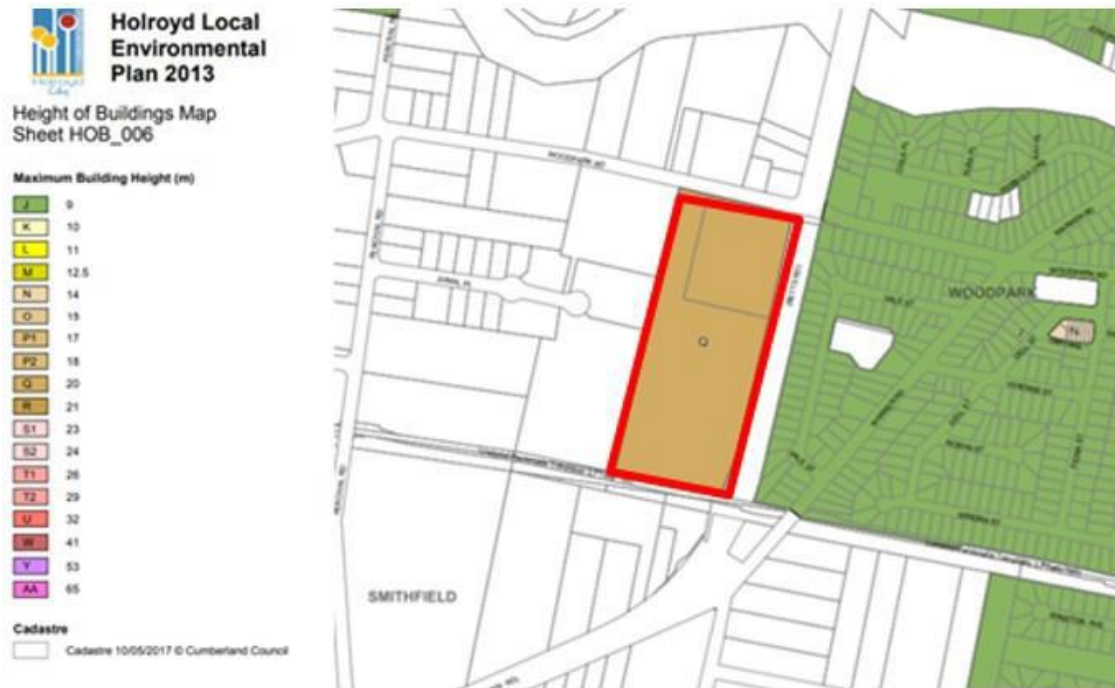
Figure 4: Existing 20m HOB control applying to the site bound in red (HLEP 2013)