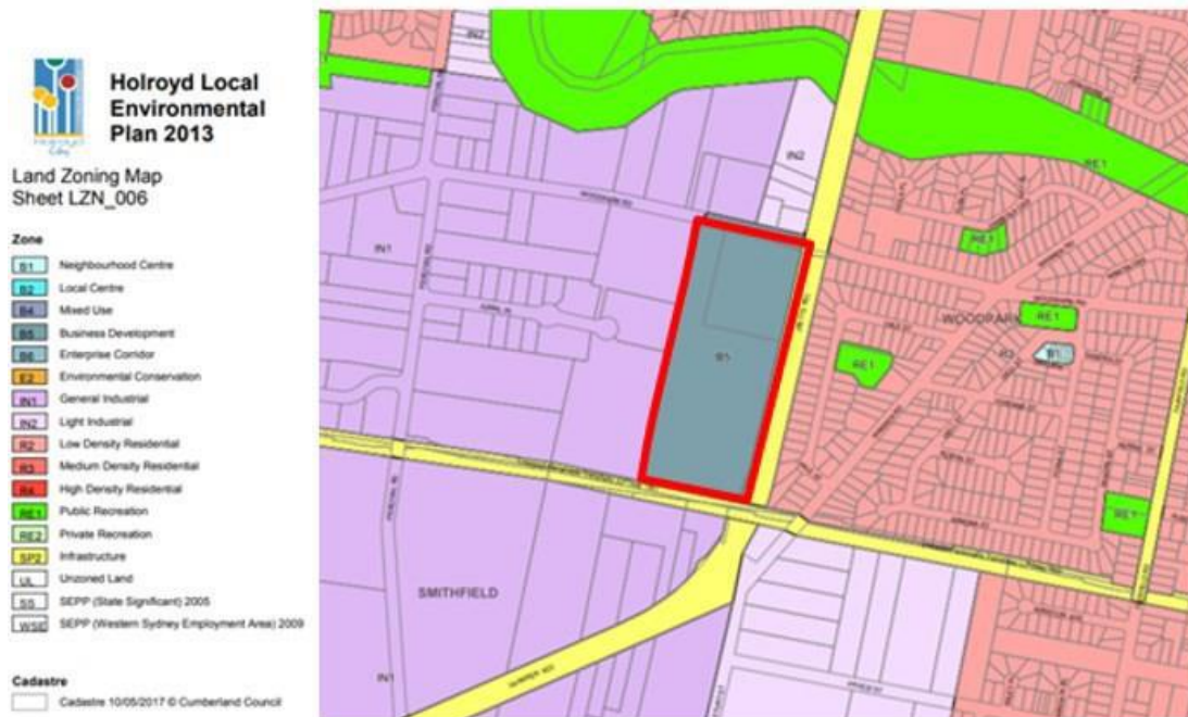
Figure 2: Existing B5 Business Development zoning over the site bound in red (HLEP 2013)

A mix of light industrial uses including freight transport facilities and several independent retail premises are located to the north. Development to the south and west is characterised by one to two storey development and more reflective of general industrial uses, including an equipment hire service centre and tile factory outlet.