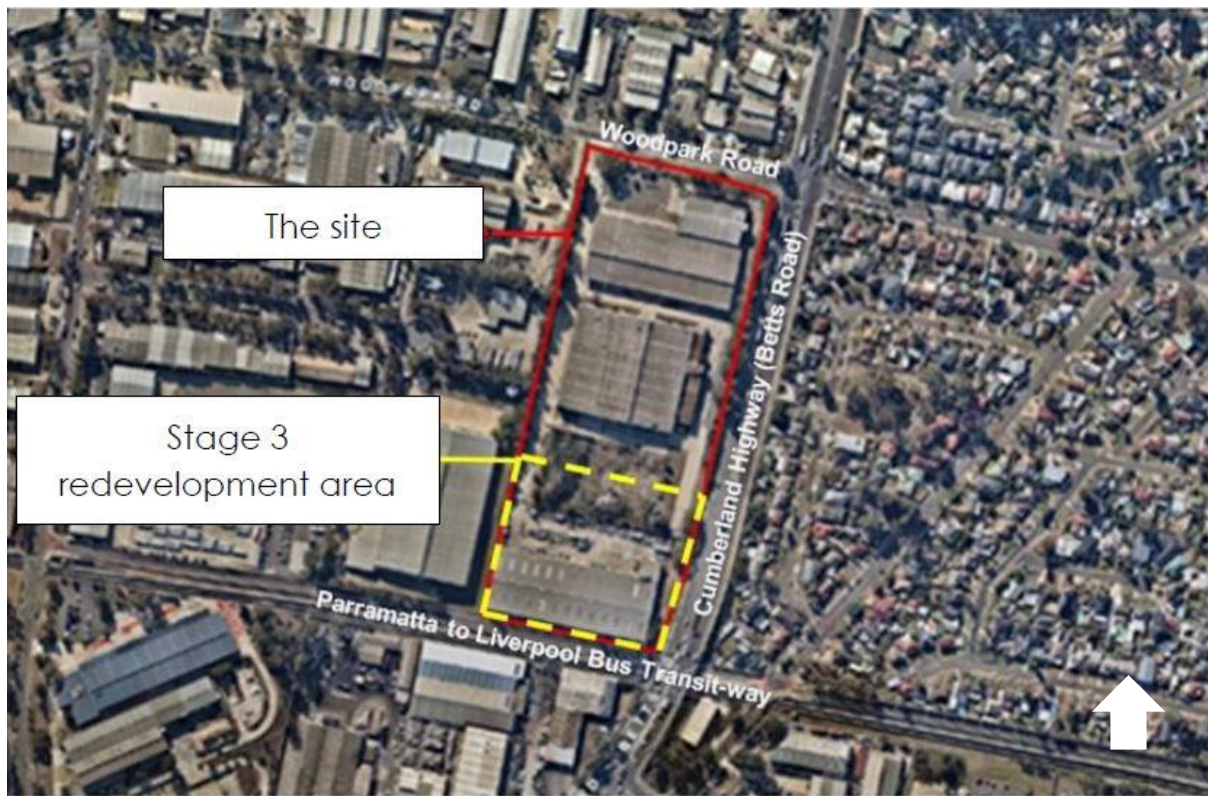
Figure 1: Aerial Image of 106-128 Woodpark Road, Smithfield.

yellow in Figure 1 except for the additional permitted uses which is intended to apply to the entire site.