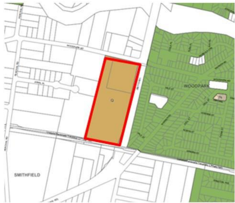
Figure 6 – Current Height of Building