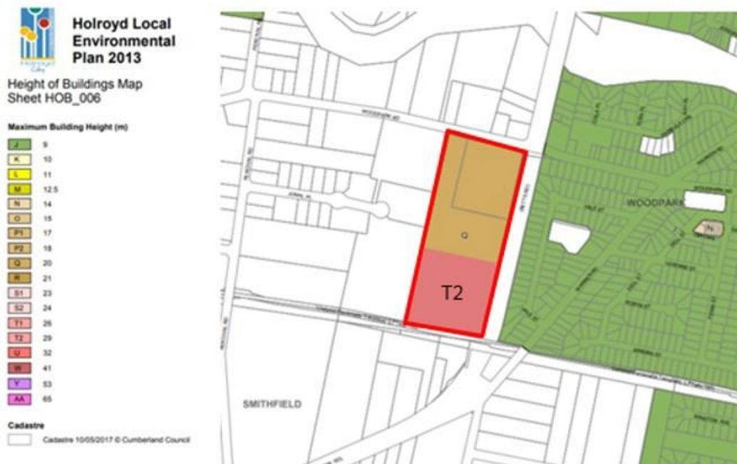
Figure 7 – Proposed Height of Buildings

Proposed Height of Building and Additional Permitted Uses maps are shown in Figure 7 and Figure 8 below.