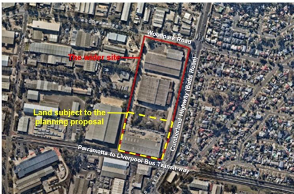
Figure 1: The Site

The site is located on the Parramatta to Liverpool Bus Transitway, with linkages to the M4 and M7. Local bus services include: T80 Liverpool to Parramatta via T-way; 802 Liverpool to Parramatta via Green Valley; 820 Guildford to Merrylands; and 821 Guildford to Smithfield Industrial Area.