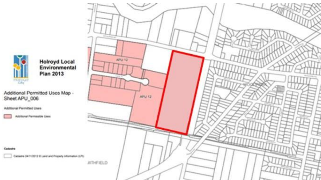
Figure 8 – Proposed Additional Permitted Uses