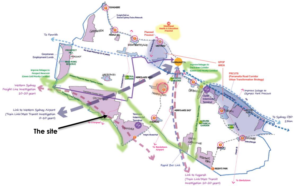
Figure 2: Regional Context