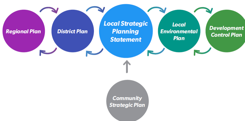
Figure 1 – Planning framework

One of the major opportunities for the community to be involved in the LEP review process is through the development of a Local Strategic Planning Statement, or LSPS. The creation of an LSPS is a new requirement for councils following the NSW Government's amendment of the Environmental Planning and Assessment Act 1979 in March 2018.