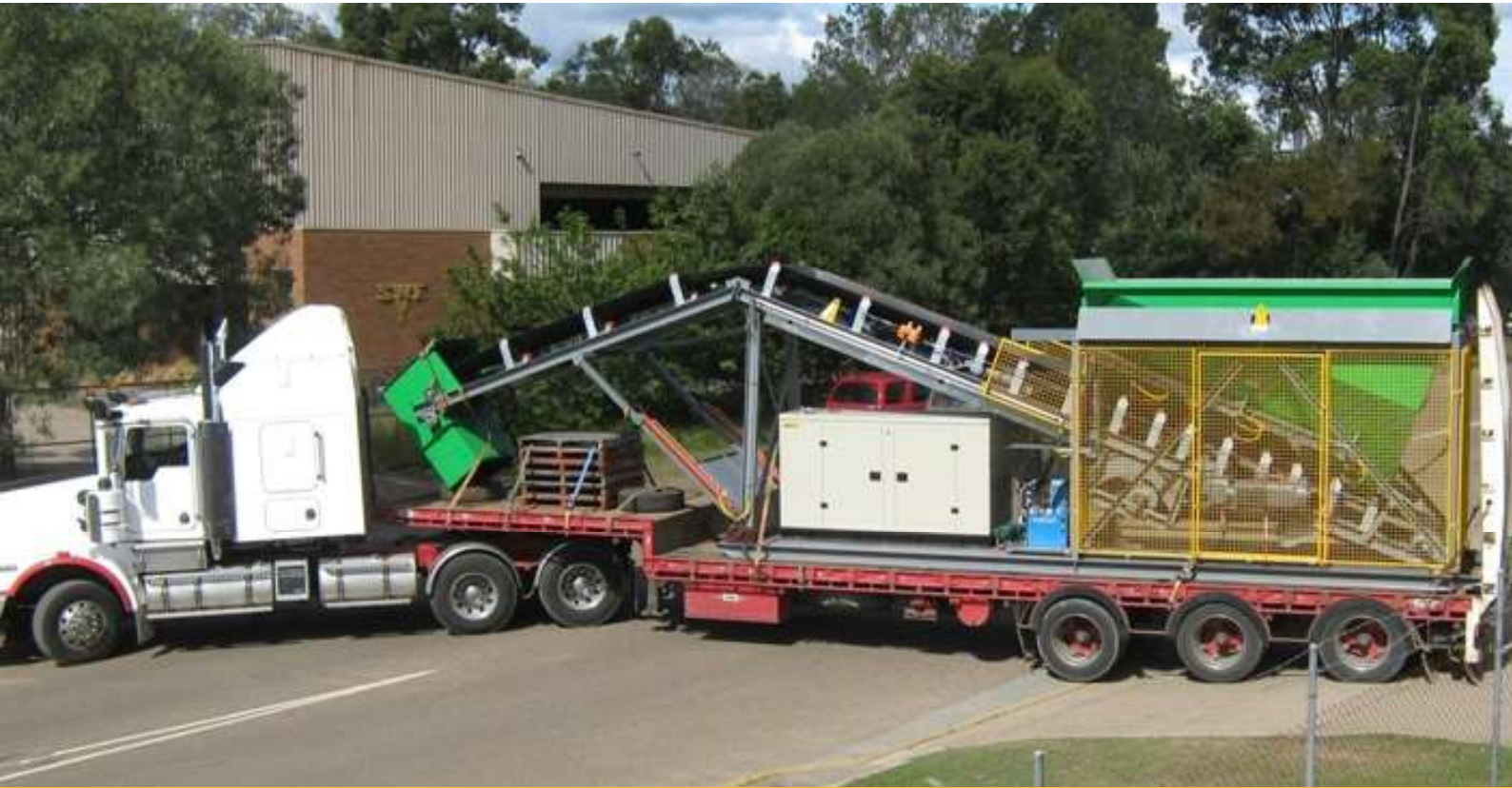
Precoat plant being configured for transport