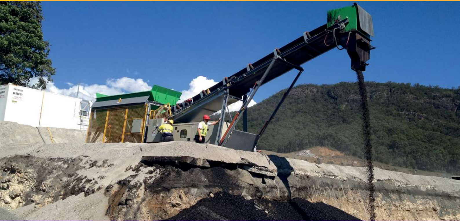
Plant producing pre-coated aggregate